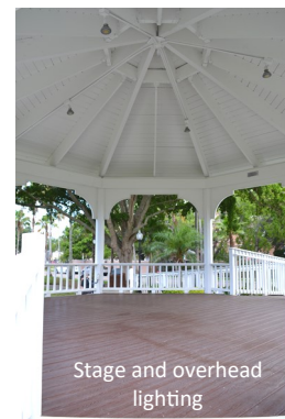
Stage and overhead lighting