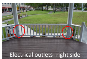
Electrical outlets- right side